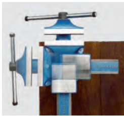
Infinitely adjustable swivel base allows vise to lock securely in any position