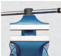
Generously sized jaws provide greater clamping surface